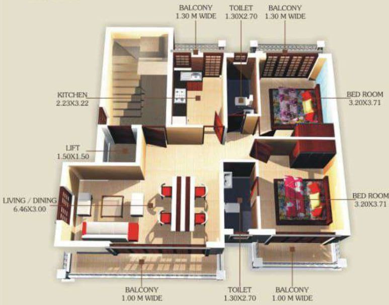
TYPICAL UPPER GROUND & FIRST FLOOR PLAN