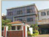
GOA BOARD - 1.8 KM