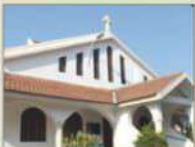
HOLY FAMILY CHURCH - 2.6 KM