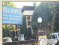
JMJ HOSPITAL - 3 KM

Enjoy listening to the humming of birds and the nature amidst the serenity and greenery of the village of Penha De France. A peaceful village far away from noise pollution of the city and yet having all the comforts of a city life.