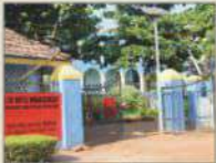
INST. OF HOTEL MANAGEMENT - 1.8KM