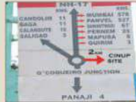
PORVORIM JUNCTION - 2KM