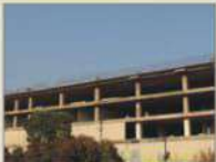
UP COMING MALL - 2.5 KM