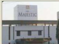
5 STAR NEO MAJESTIC - 3 KM