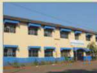
HOLY FAMILY SCHOOL - 3.6 KM