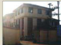
PORVORIM POLICE STATION - 2.8 KM