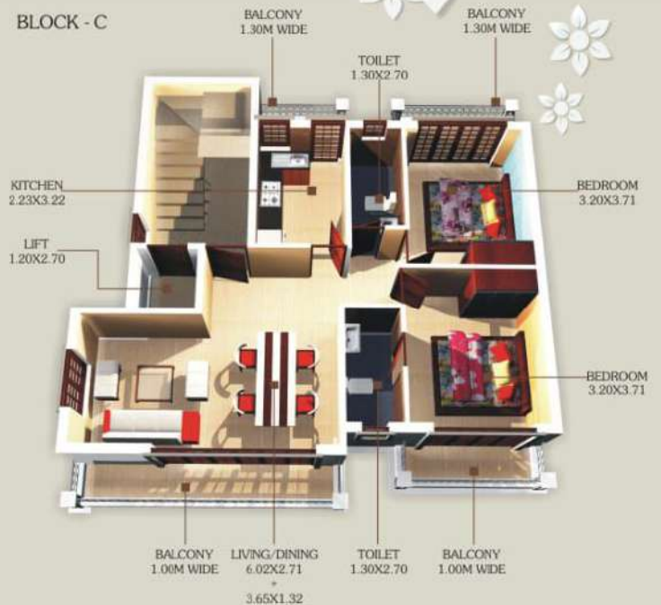
UPPER GROUND, FIRST & SECOND FLOOR PLAN