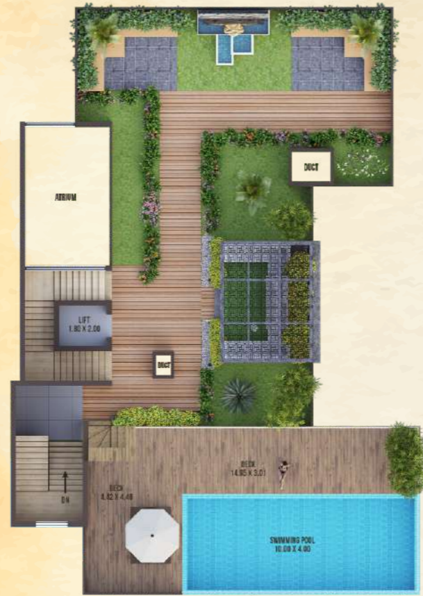
TERRACE FLOOR PLAN.