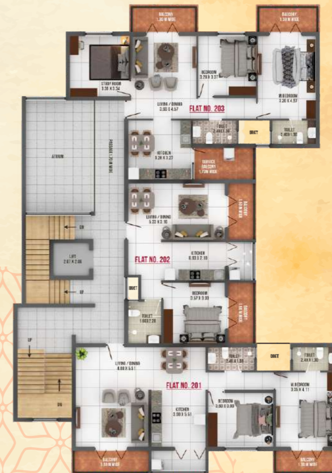
TYPICAL 2nd, 3rd, 4th, 5th & 6th FLOOR PLAN.