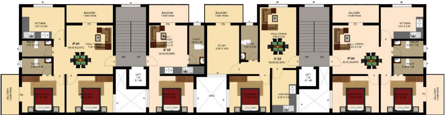
INTERMEDIATE FLOOR PLAN